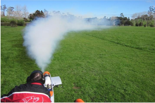
Smoke, smoke and more smoke. Ross Purdy tries out the new smoke unit in his new jet.