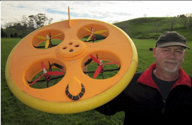
Another "different" quad copter from Nigel Boyd