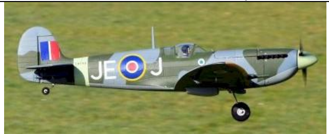
(P.D's.) Spitfire on finals. Now that's great photography