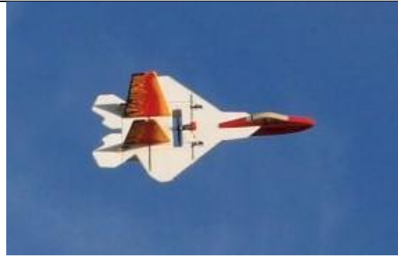
(P.D's.) Homebuilt F22 made from depron foam.