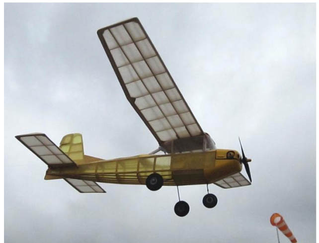
Stan Somerfield's free flight Vick Smeed designed Debutant coming in on finals