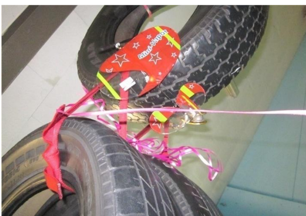
Jim Hall's new ParkZone Mini Vapor finding where the tyres are at the indoor flying.