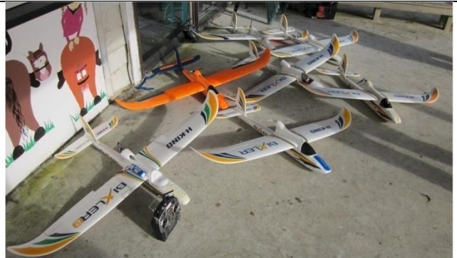
A whole heap of Bixlers seen at the field. Sure makes a change from Bees.