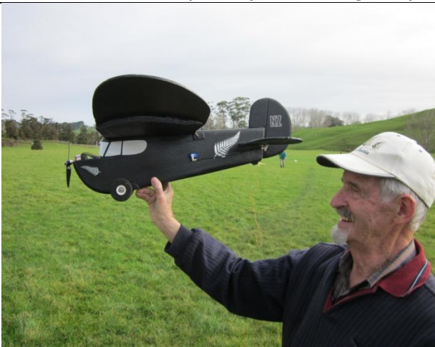
Noel Newling's new Bee. But will it look like a black blob when its flying.